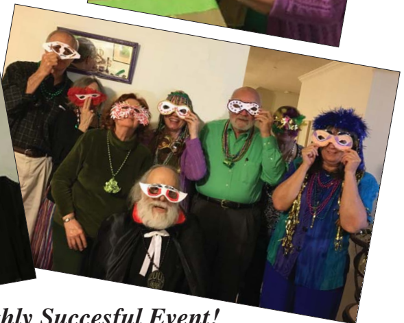
A Highly Successful Event!