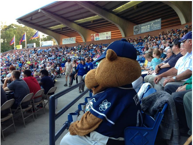
3. Live baseball -- this is "Ted E. Tourist" and live fans at an Asheville Tourists game at McCormick Field