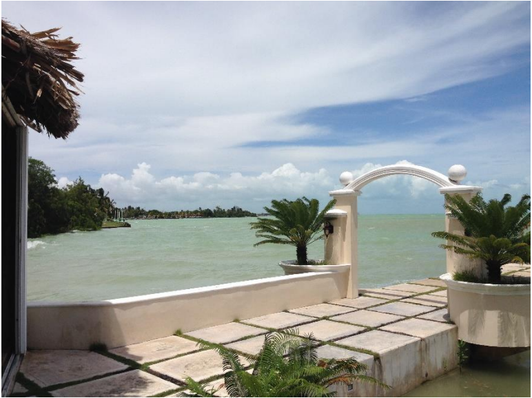
2. Belize – the international airport was closed from early March to October 1 and restrictions on tourism remain in effect (negative Covid test, daily check in on app, only certain hotels and tours are open to visitors, etc.) This is a photo of the Bay of Corozal in Corozal Town in Northern Belize.