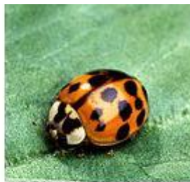
Asian Lady Beetle

While these bugs are a blessing for farmers and our food supply, they are annoying for homeowners. They like to come indoors when the weather gets cold, just like stinkbugs.