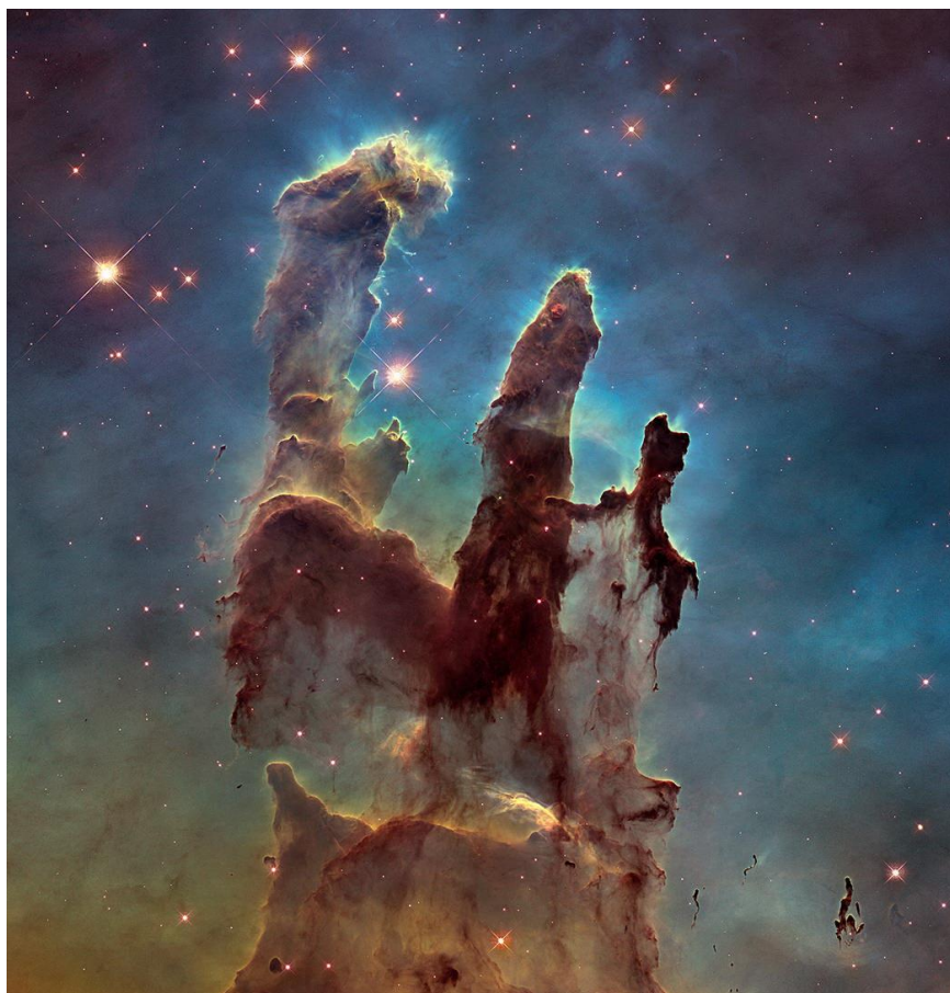
Pillars of Creation

Vol. 27, No. 9, September 2021 http://frenchbroad.us.mensa.org