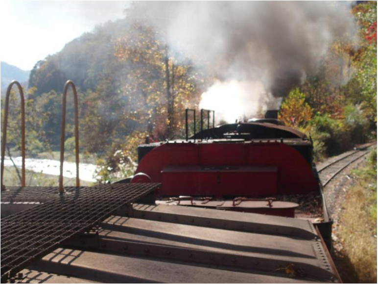
Nantahala Gorge