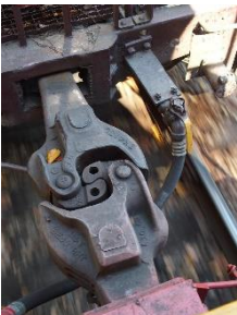
Knuckle Coupler