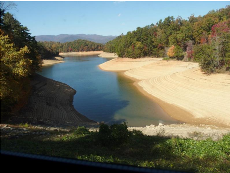
Fontana Lake