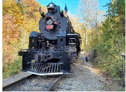
Our train Will McGuffin photo