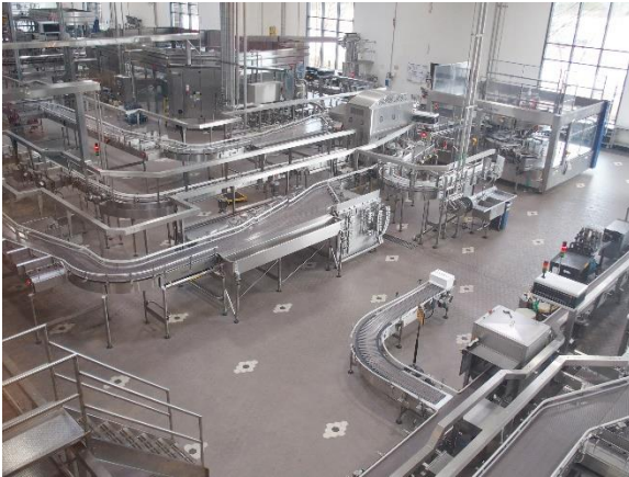
Looking down into the area where bottles, cans, and kegs of beer are organized for delivery.

Our Second Saturday special event for February was a tour of the Sierra Nevada Brewery in Mills River. We learned about the chemistry of beer-making, the packaging and distribution of products, and enjoyed a taste of four different beers.